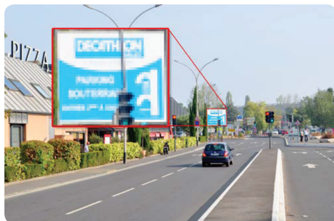
Conventional Analog Camera

The HDTVI solution offers real-time HD video output at HD1080p / HD720p with maximum frame rate of 60 fps. Analog users can now enjoy enhanced HD video quality images.